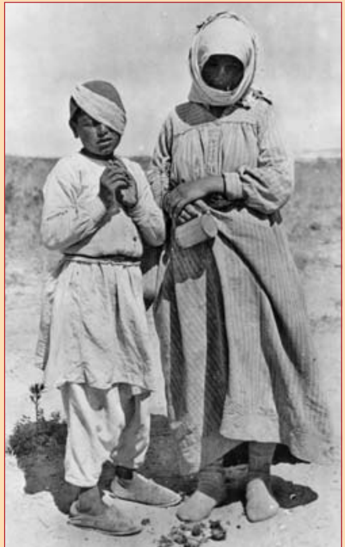
1919: An Armenian refugee woman and her son.

Although Armenia was at times a kingdom, in modern times, Armenia has been an independent country for only a few years. It first gained independence in 1918, after the defeat of the Ottoman Empire in World War I, but this ended when Armenia was invaded by the Red Army and became a Soviet state in 1920. With the dissolution of the Soviet Union in 1991, Armenia was the first state to declare its independence, and remains an independent republic today. Armenia is a democracy and its borders only include a very small portion of the land that was historic Armenia.